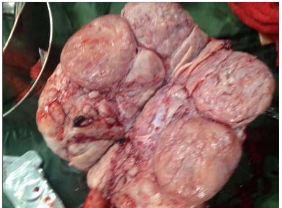
fibroid at the fundus of Uterus - on cut section