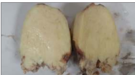
cervical fibroid on Cut Section